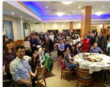
ACCS Annual Dinner, November 2016, Philadelphia, USA.

Friday, 11/17, 6:00 p.m. - 8:00 p.m. Royal Szechuan Restaurant 400 N Greenville Ave. Richardson, TX 75081 972-234-8889 $25/person including tip