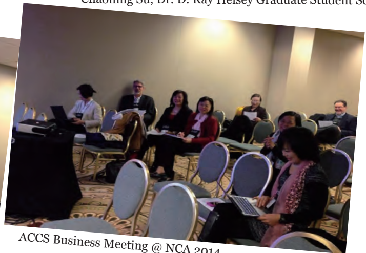
ACCS Business Meeting @ NCA 2014