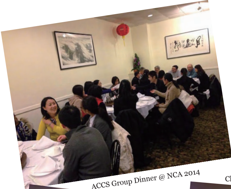
ACCS Group Dinner @ NCA 2014